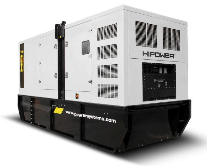
Photo depicts a typical model but may not include options such as trailer.